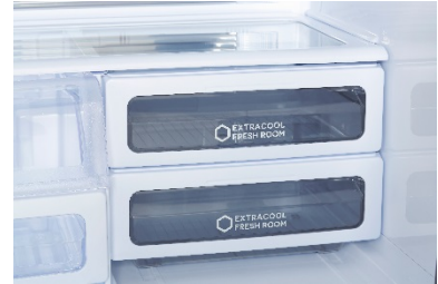
Special compartments for quick food and drink cooling