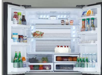
Efficient fridge compartment and door pockets usage