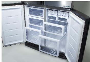
Clear drawer iconography for a convenient food storage in both fridge and freezer compartments