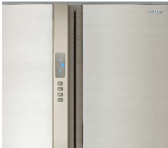
Control panel with electronic temperature and other functions' control