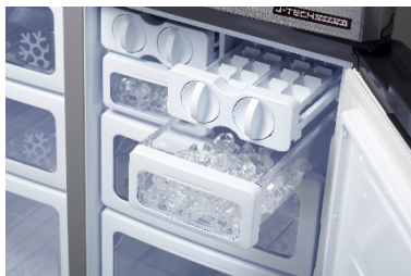
Twin Ice Cube makers with ice containers