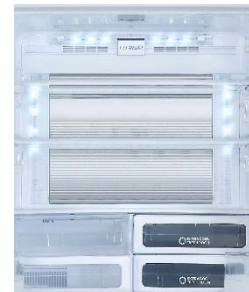
Multipoint LED lighting increasing brightness inside the compartment