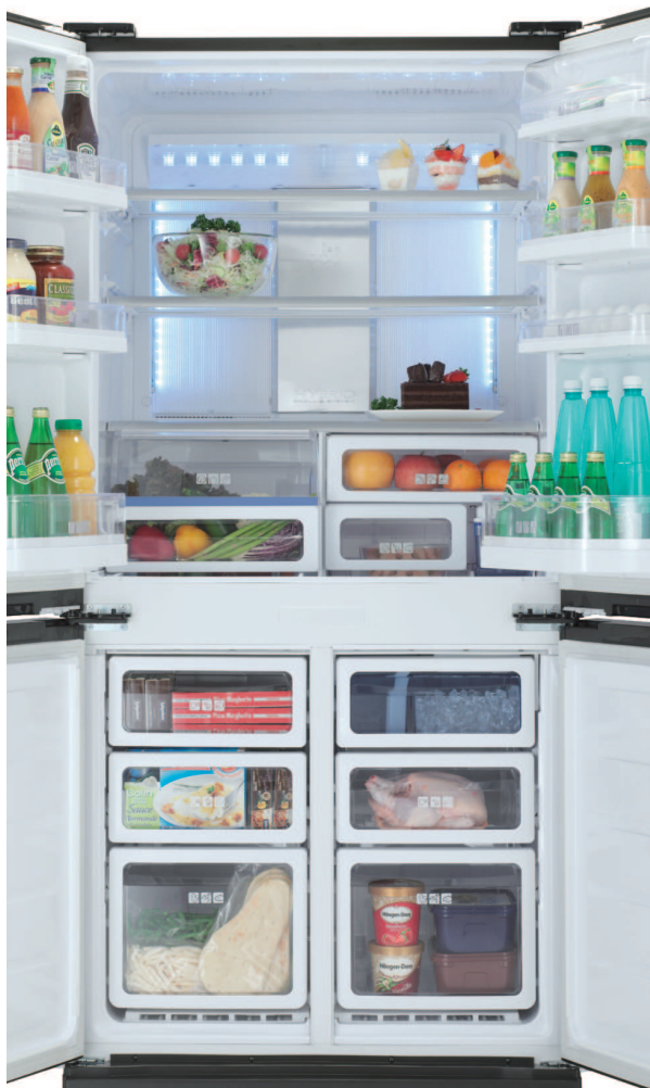
Unique Design Variation