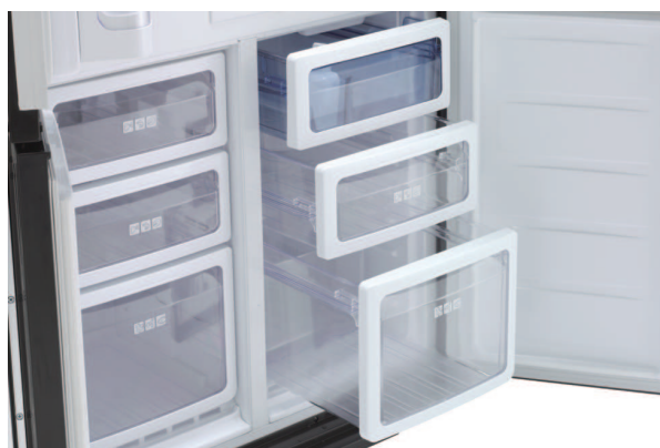
Diversified Freezer Compartments. A right storage for your frozen needs provided by the system of 6 sliding containers that keep your food sitting comfortably and under stable conditions.