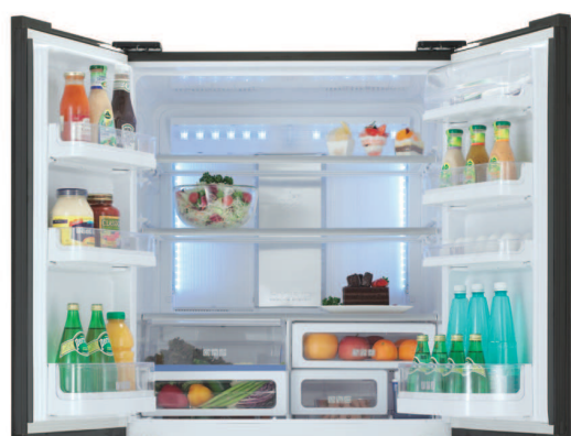
Unique door mechanism (this technology was patented by Sharp in 2006). Conventional French Door models use mid door pillar in order to seal the gap between the right-side and the left-side door and thereby decrease the available door storage space. Sharp's unique door design eliminates the central column between the doors offering more door storage space and improved reliability. This means that Sharp refrigerators can provide as much as 100 lt of additional space as compared to conventional models of the same type. Sharp is the only company offering such solution.