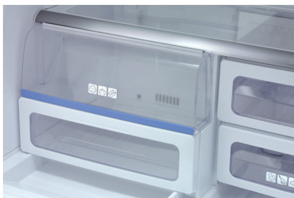
Fruit and Vegetable Case. Bigger and organized compartment. Covered vegetable drawer case locks-in the freshness of your high-moisture food items like vegetables and fruits. Its spacious compartment also helps in keeping your food items conveniently.