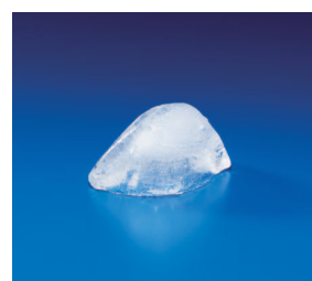
4 degrees of ice cube transparency