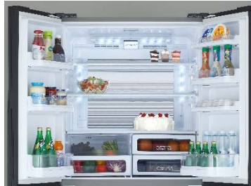
Effective fridge compartment and door pockets usage