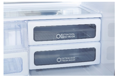
Special compartments for quick food and drink cooling